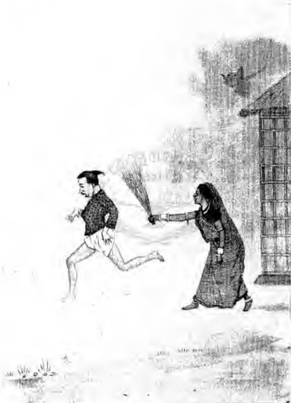
"Thrashed him soundly till he rushed out of the house howling."